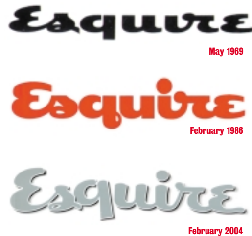
Esquire's logo circa May 1969 (top) had evolved into "a grotesque blob" by the 1980s. Its 1991 revision was jazzed up with an inline, shadow and kink with the s overlapping the q for its Dubious Achievements issue, February 2004 (bottom)

who you've looked like rather than looking like somebody else."